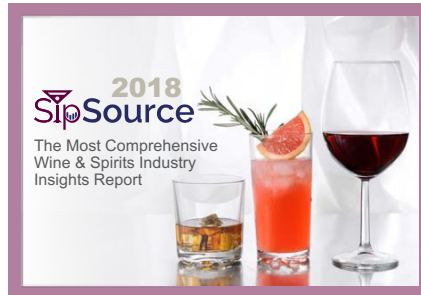
Annual SipSource Report (PDF)