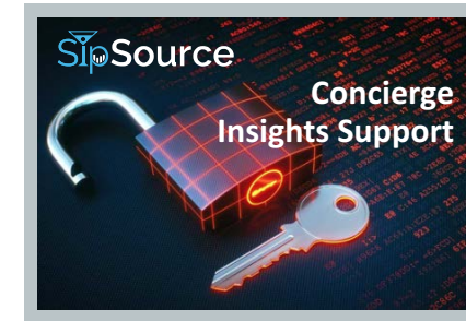
Concierge Insights Support