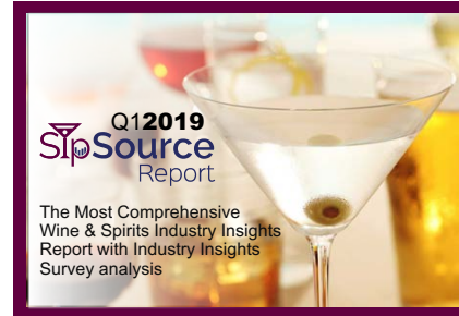
Quarterly Report with Industry Survey Analysis