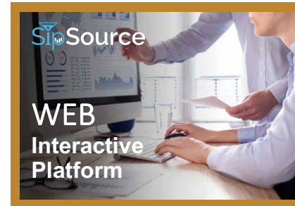
Web Interactive Platform